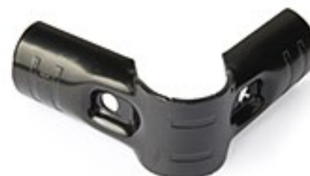
H-3 (Ungrip Type)