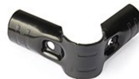
H-3 (Ungrip Type)