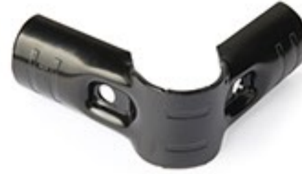
H-3 (Ungrip Type)