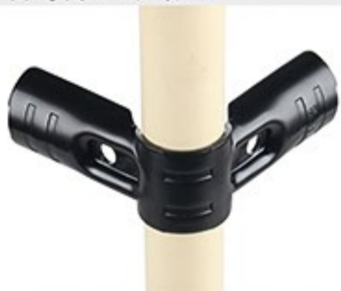
H-3K (Grip Type)