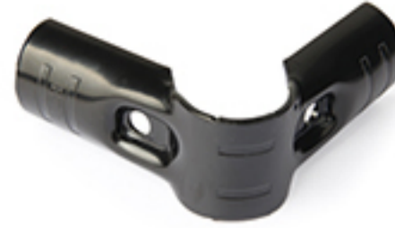
H-3 (Ungrip Type)