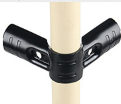
H-3K (Grip Type)